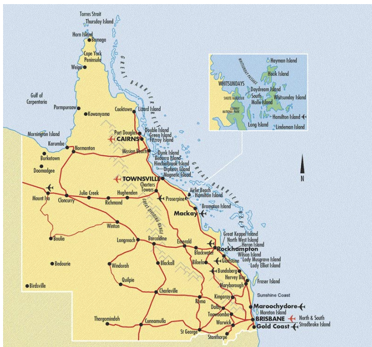
Powerlink Queensland operates and maintains the 1700km high-voltage electricity transmission network for all of Queensland, the second largest state in Australia.

Also, if a worker is not using the latest version of a drawing, errors can occur. With Powerlink’s real-time drawing viewing system, made possible by standards-conformed data from CADconform, workers now have access to the very latest version of the native CAD file, ensuring use of the latest and greatest information, helping to eliminate errors resulting from using outdated drawings.