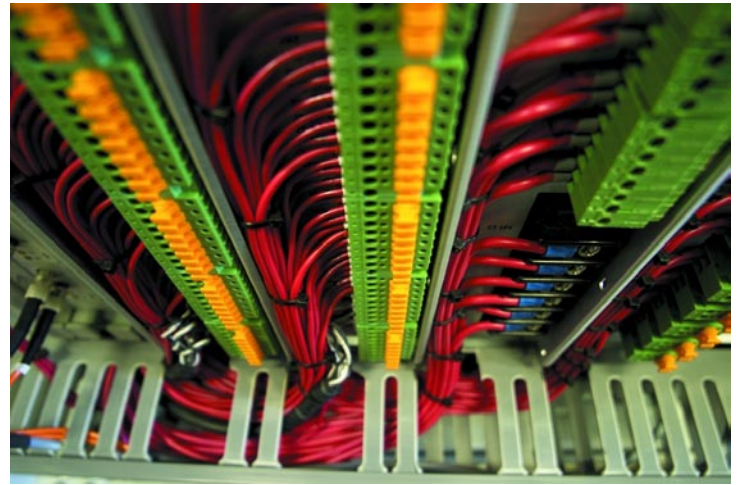
CAD drawings are a critical information source for the ongoing operation and maintenance of Powerlink's extensive network.

"But for the viewer to display drawings correctly, the CAD file must be configured correctly. For example, elements must be placed on the correct layers. But there are also certain layers with drafter-only information that must also be turned off for correct viewing," explains Steer. "CADconform ensures that all drawings are configured correctly so they display accurately in our real-time viewing system."